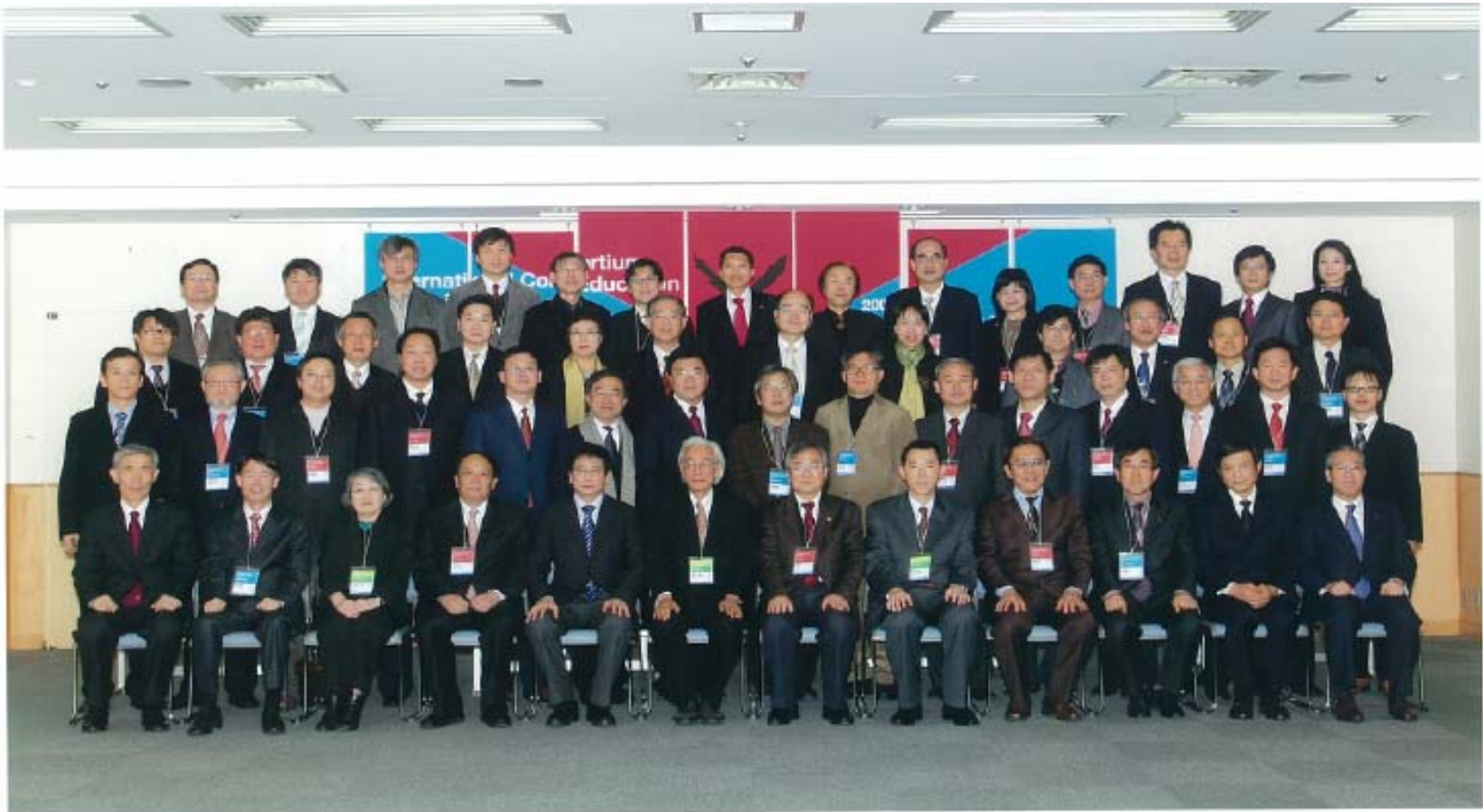
The Formation of International Consortium for Universities of Education in East Asia on December 18th, 2009.

http://www.u-gakugei.ac.jp/~icue2009/history/data/prepa200912-2.xdw