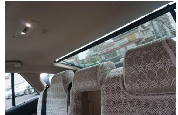
'New Partner' Toyota CROWN G-Executive (start co-working 26 July 2018)