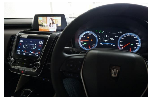
'New Partner' Toyota CROWN G-Executive (start co-working 26 July 2018)