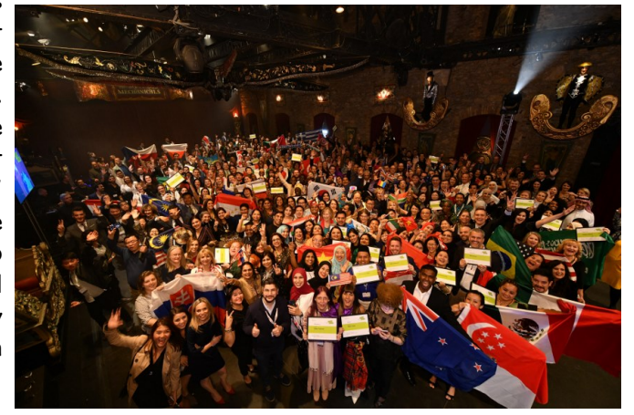
MIEE Education Exchange

For this project, Microsoft Japan Co., Ltd. contacted the Microsoft Showcase Schools program organizers in Denmark via its Danish subsidiary Microsoft Denmark ApS.